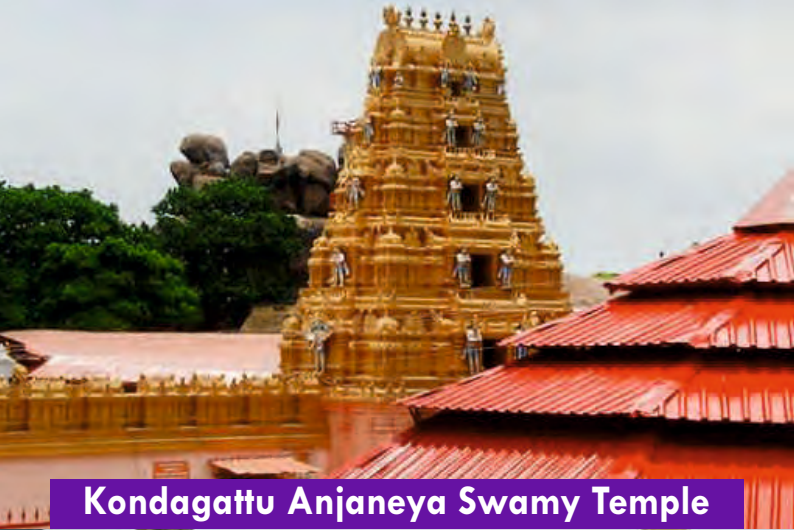
Kondagattu Anjaneya Swamy Temple