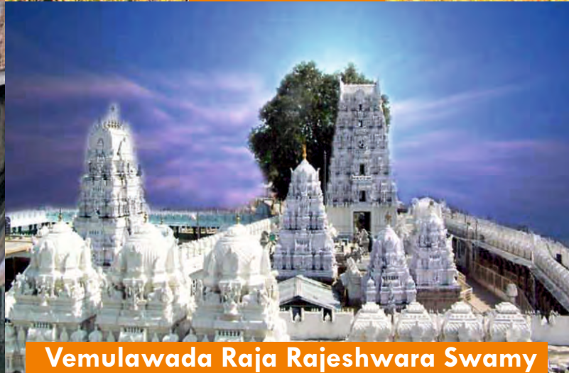
Vemulawada Raja Rajeshwara Swamy