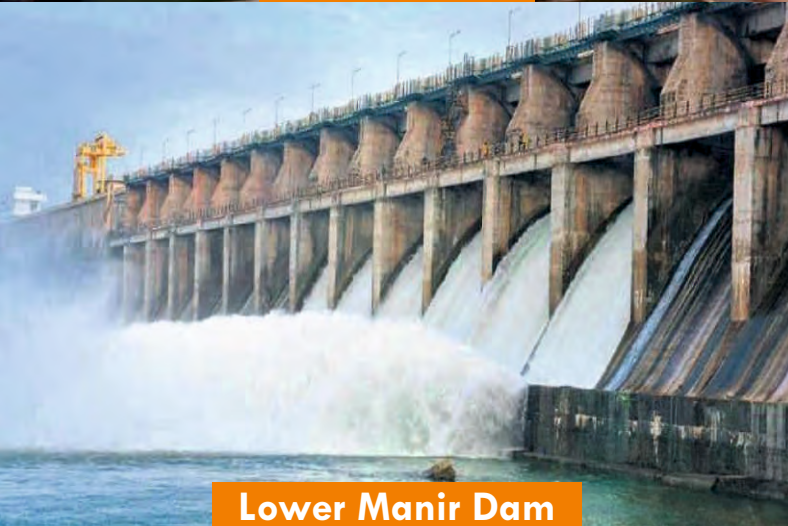
Lower Manir Dam